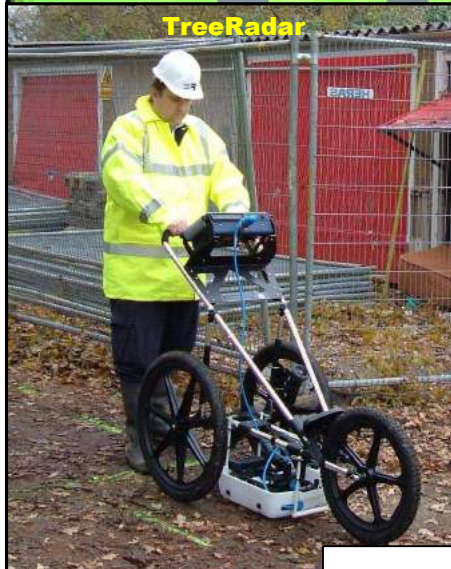
TreeRadar: Informed root assessments