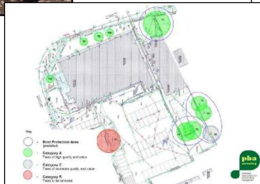
Tree constraints plans