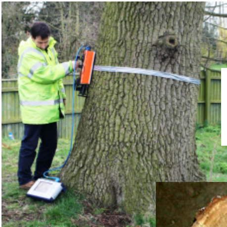
Radar Antennae being used to scan the internal section of trees